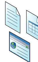
Laundry Service Quality and Timelines Report