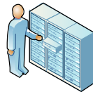
Laundry dept collects from Smart label aware linen drop