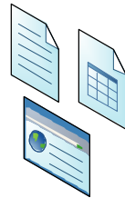
Floorwise distribution Report