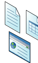
Room wise billing and distribution Report