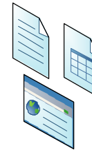
Laundry Service Quality and Timelines Report