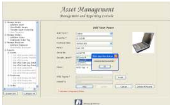
Add and Assign Assets to People