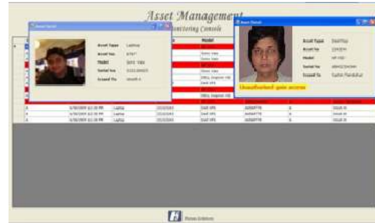
Access Control using Visual Notifications