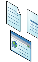
Roomwise distribution Report