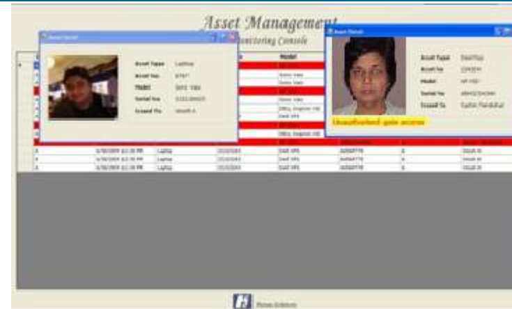
Access Control using Visual Notifications